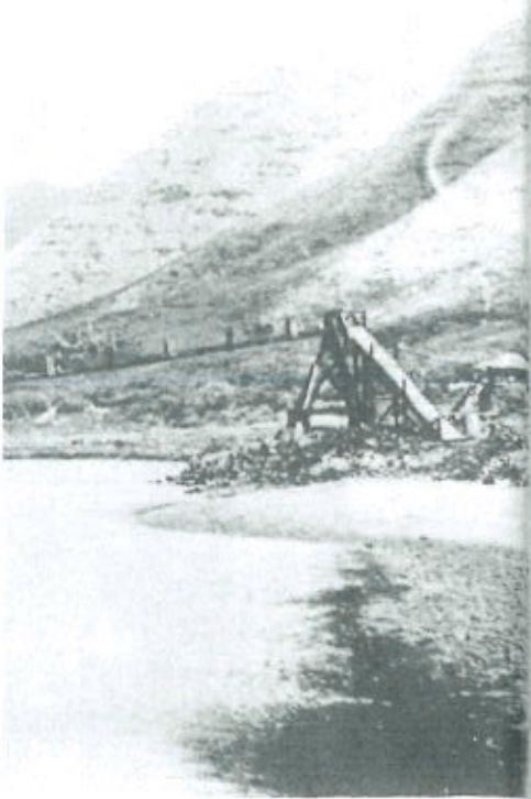
holuholu o Halawa.